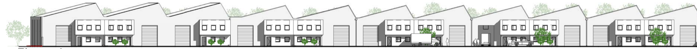
Columbus Cresent Elevation