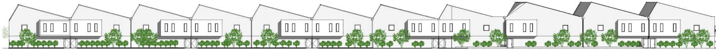
Rivergate Drive Elevation